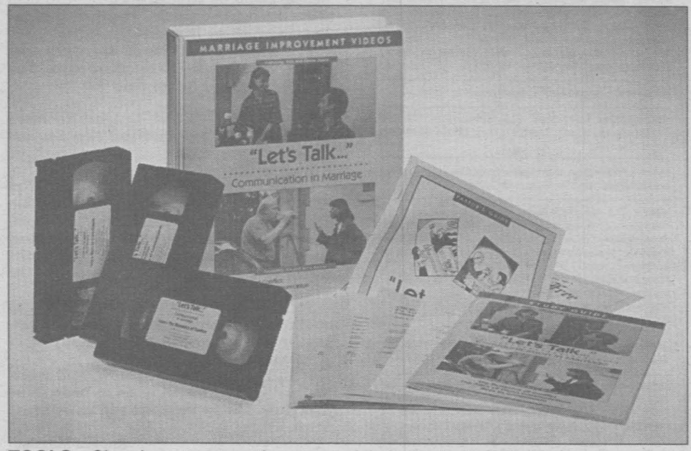
TOOLS —Church pastors use these materials in the Let's Talk video program.

When these things are considered. teaching people to solve their own problems makes sense, he concluded.